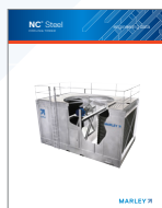
NC Steel Engineering Data