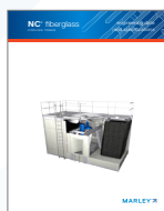
NC Fiberglass Engineering Data and Specifications

For further information about the NC Cooling Tower – including engineering schematics, data, layout requirements and more – download these NC publications and others at spxcooling.com .