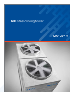
Marley MD Cooling Tower

SPX Cooling Technologies offers a full line of industry leading products – with exceptional support and innovation designed to help you get the most out of your cooling process. Take a look at these other Marley products at spxcooling.com .