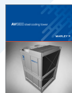
Marley AV Cooling Tower