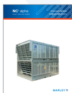
NC Alpha Splash-Fill Cooling Tower