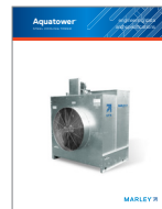
Marley Aquatower® Cooling Tower