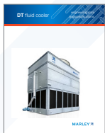
Engineering Data and Specifications

For further information about the DT Fluid Cooler – including engineering schematics, data, layout requirements and more – download at spxcooling.com