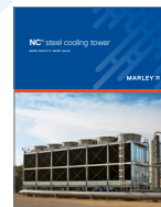
Marley NC Cooling Tower